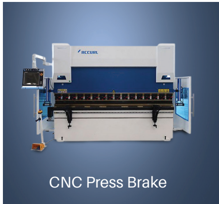
CNC Press Brake

We Specialise in Stamping Components, Precision Sheet Metal Fabrication, Enclosures, Machined Components, Industrial & IT Racks, Mechanical Assemblies, and 3D-Additive Metal Printing.